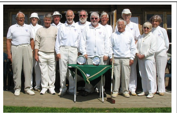
Wilson Salvors Competitors