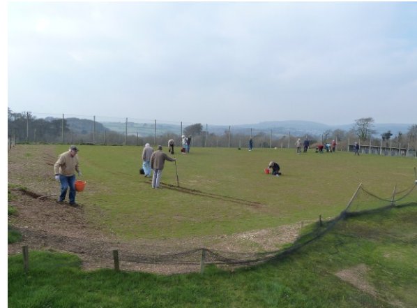
Stone picking on lawn 3

Lawn 3 This has had initial fertilising, plus infilling of the worst of the rabbit scrapes, with some local re-seeding. It has also been surface dressed with an improvement to local dents & hollows. Stone picking provided a picture of what an onlooker might have assumed was an exercise in primitive agriculture!