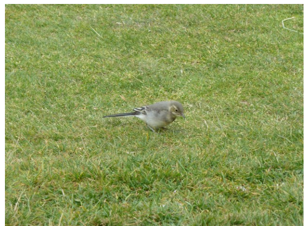
A satisfied new customer

Junior section Members will I'm sure be delighted that the wagtails have successfully produced a pair of youngsters, who are by now well aware of the benefits of the Club as a café! Already I have had to escort one of the fledglings out of the Pavilion.