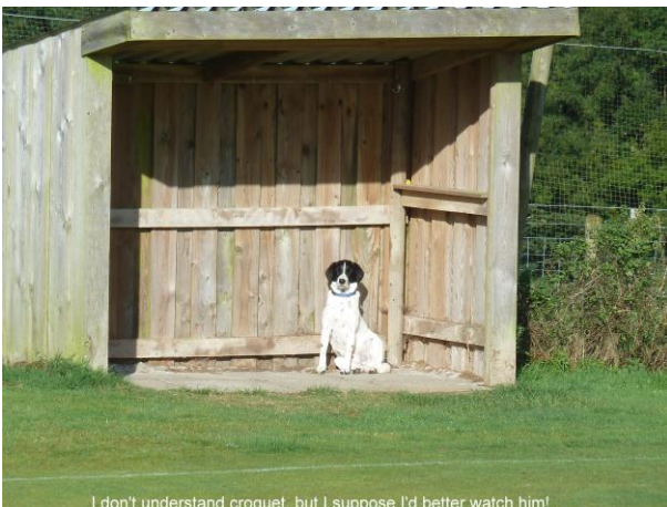
I don't understand croquet, but I suppose I'd better watch him!

I can't resist adding a couple more from the competition: