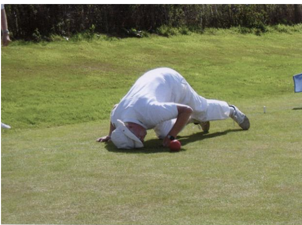
I think this is the red ball!

The caption was: "I think this is the red ball".