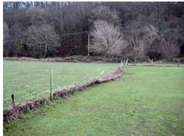
Barnstaple CC, January 2013

a couple of days in North Devon in early January, and looked in on their lawns. These are sited on the flood plain of what is normally a small tributary river. This had badly flooded, and it was obvious that 12 – 18 inches of water had swept across their lawns, the weight of debris having collapsed part of the upstream boundary fence. As they had not managed to play before late July in 2012, it seems their problems can only be worse this year.