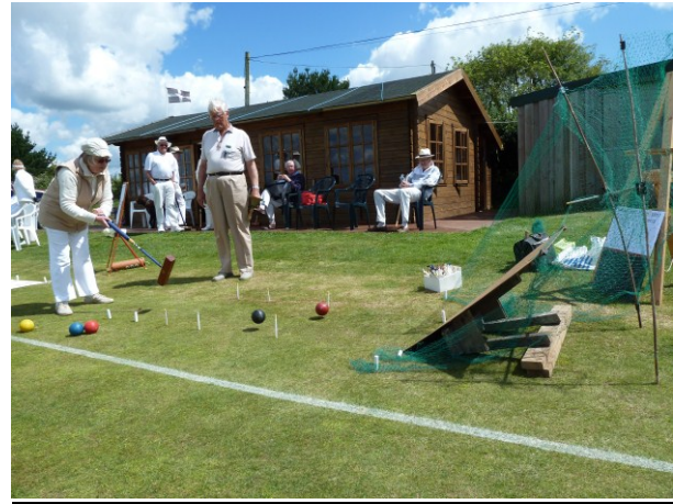
A reminder – sometimes the sun DOES shine.

Social If any members have ideas for social events, please don't be slow in coming forward with them!