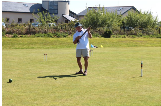
Which grip is this???

From the photo competition and elsewhere: -