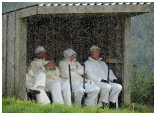
Not every day this summer was perfect!