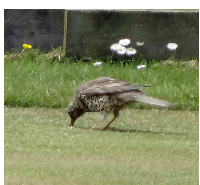
Caught damaging the lawn!