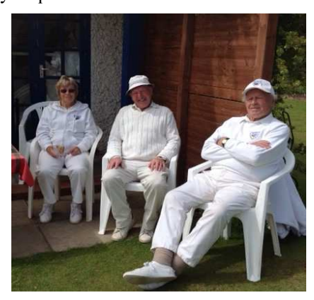
Members of Porthpean GC team enjoying a chat with the team captain from Exeter club.