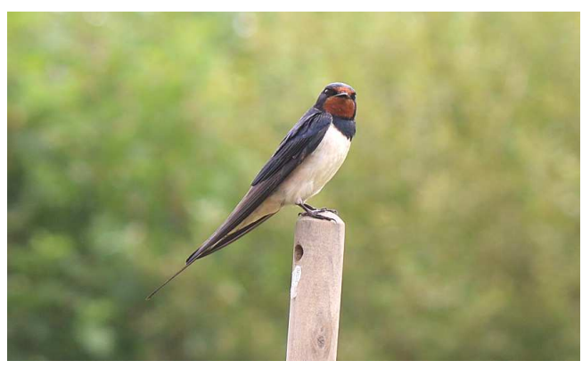
One of our newest members, June 2017. The pair successfully raised 3 chicks whilst with us. Perhaps they will return next year now they know we're