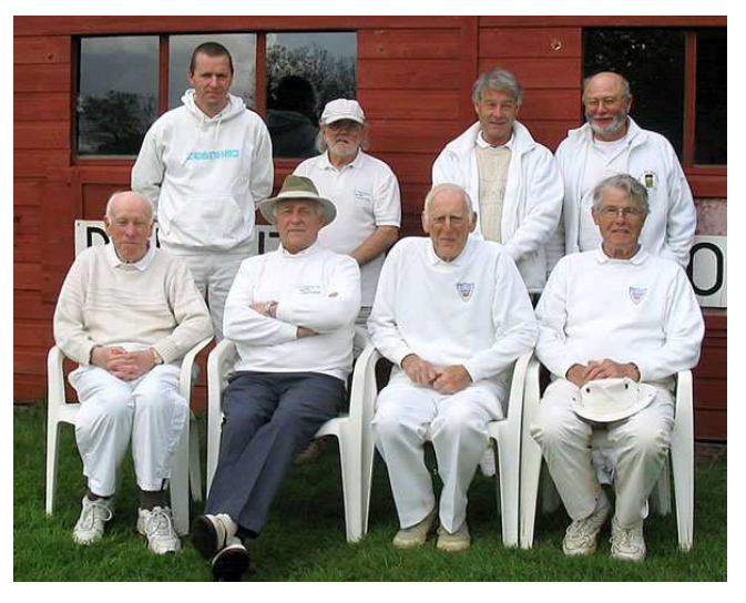
Extracted from our own club Newsletter - A SW Federation League AC match at Plymouth in May

We shall miss him here but our thoughts must be with his family for the loss they have suffered.