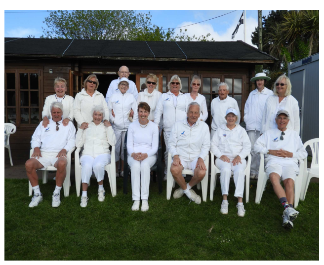
Members of Cornwall Croquet Club and East Dorset Croquet Club at the end of an enjoyable day.

At the beginning of the season we welcomed a team from East Dorset Croquet Club to a friendly match. This was a very informal affair which I am happy to say Cornwall won. A very enjoyable day and a good result. Some of the East Dorset members enjoyed their visit so much that they returned on one of the Open Afternoons to play.