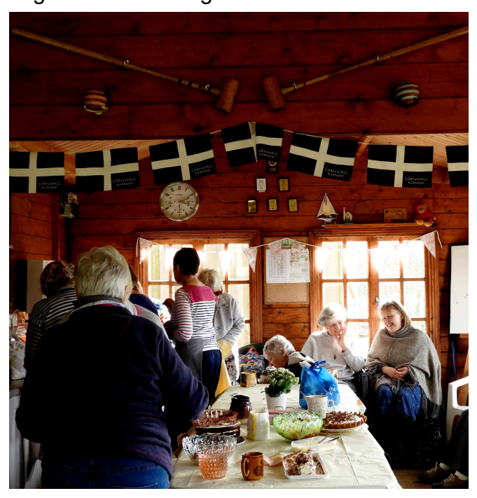
The 'Puds' revealed.

So, what's been going on since the last Newsletter? The winter indoor games sessions continued despite some very cold weather and, of course, that event which is rapidly becoming a permanent fixture in our club calendar - 'Pasty and Pud'. This was held in early March and provided a much appreciated opportunity for members to get together in that long hard winter.