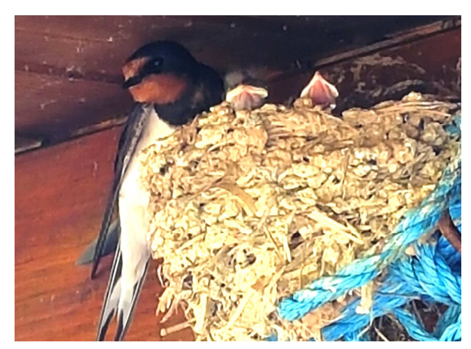
Happily our feathered friends managed to make the journey back to us this year.

Your attention is drawn to the club's Code of Good Practice - Safeguarding Childrency on the noticeboard above the bookcase. As we have more children visiting the club please read it and adhere to it. This exists for the benefit of us all.