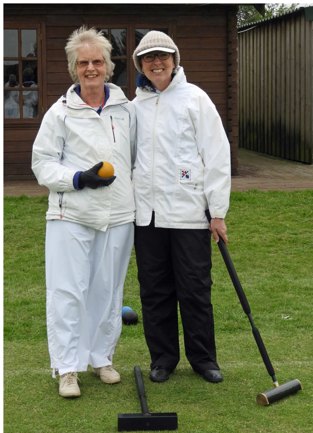
The two finalists putting on a brave face in the cold, wet conditions. Well done to both of them.

Moving into May our South West Federation League matches started. As previously noted, this year we only have three league